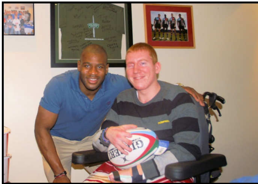
Quins v Sale 19 th February 2011

Strong personal support from the rugby players means that it is nearly always possible to have inspirational rugby celebrities in the Box and give patients an opportunity to meet them and have a souvenir photograph taken. We normally print these photos, get them photos signed and framed, and then send them on to Headley Court as mementoes.