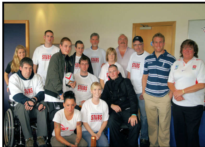
Quins v Saints 12 th September 2010

STUBS (as in "ticket stubs") is a registered charity that provides practical support for our members – UK armed services personnel injured on duty, war widows and their dependents, service veterans, and other armed services personnel who need our support. A key aspect of STUBS work is support for the UK's most seriously injured servicemen and servicewomen, who are in-patients at the Defence Medical Rehabilitation Centre (DMRC) at Headley Court, Epsom.