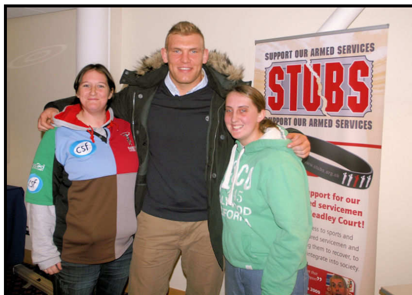
Quins v Cardiff 6 th February 2011