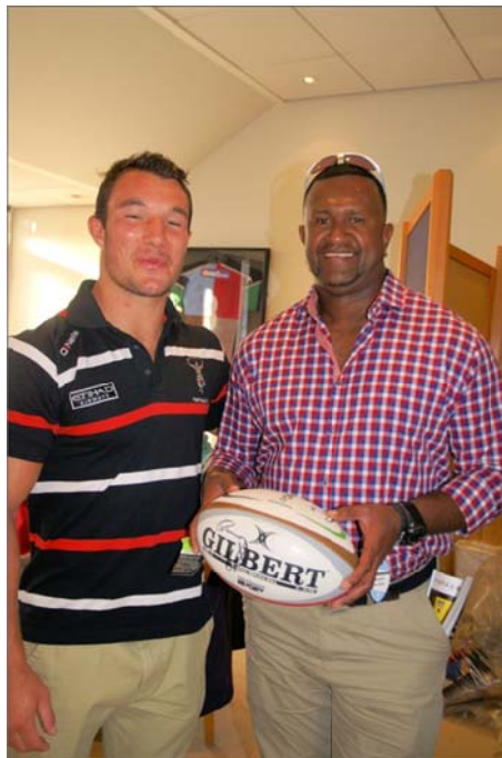
Winning Again! Quins v Sale