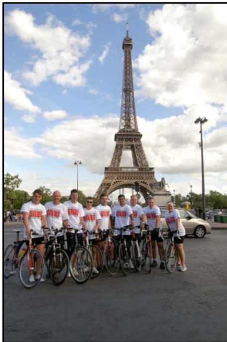
STUBS London To Paris Cycle Challenge

Our next Cycle Challenges are in August 2017. On Friday 18 th August we'll launch our Bruges 100 Cycle Challenge for novice lady cyclists, and the following Friday 25 th August we'll launch our Paris Cycle challenge for more experienced riders.