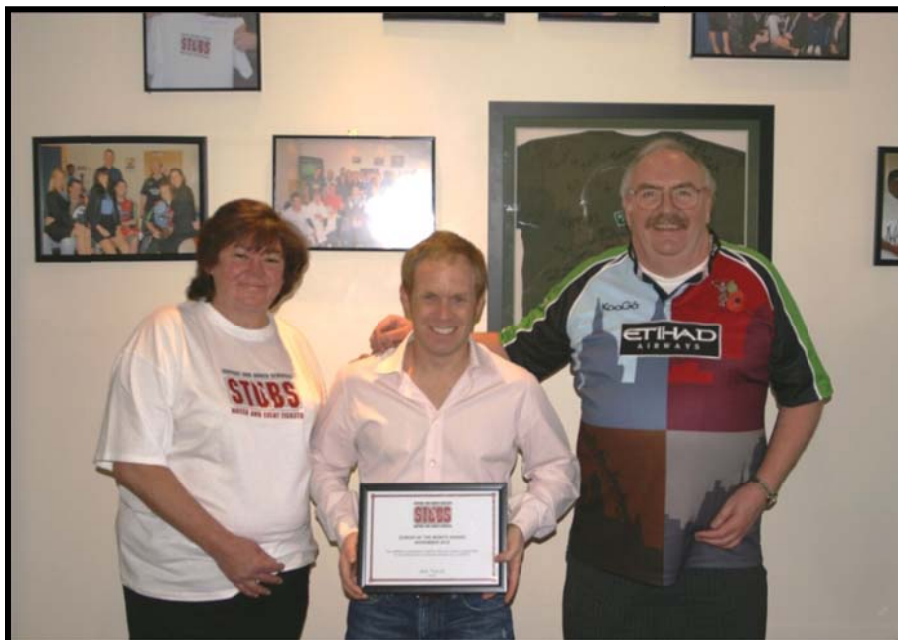
A Big Thank You To One Of Our Fundraisers

Our only income is from donations, or from fundraising events. Whilst we have sought grant aid from them, STUBS is not supported by Help for Heroes, and we usually have to pay the standard commercial rate for box hire and food at events.