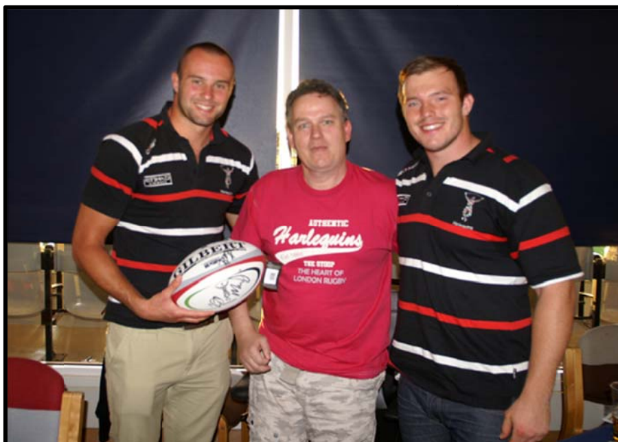
Draw Winner For A Signed Match Ball