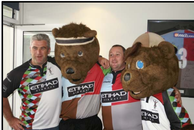
Harlequins Mascots Charley and Harley, with Guests at The Stoop

STUBS (as in "ticket stubs") is a registered charity that supports the rehabilitation and social re-integration of the UK's most seriously injured servicemen and servicewomen, who are in-patients at the Defence Medical Rehabilitation Centre (DMRC) at Headley Court, Epsom.