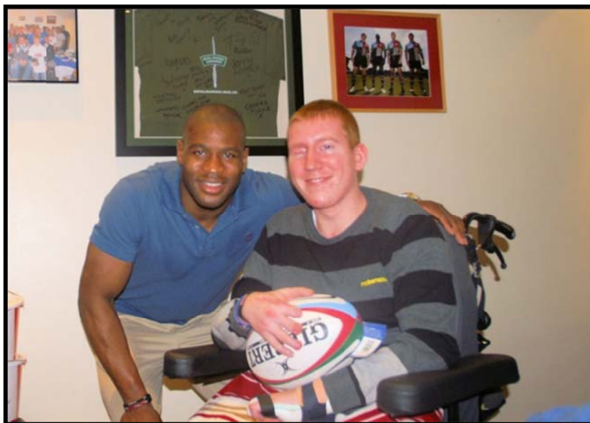
Quins Star Ugo Monye with a Guest from Headley Court

Strong personal support from the rugby players means that it is nearly always possible to have inspirational rugby celebrities in the Box and give patients an opportunity to meet them and have a souvenir photograph taken. We normally print these photos, get them photos signed and framed, and then send them on to Headley Court as mementoes.